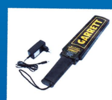
Hand Metal Detector